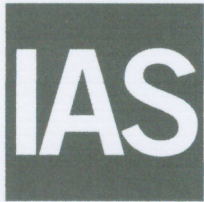
King Cert International Certification Ltd. Director

ACCREDITED Management Systems Certification Body MSCB-196